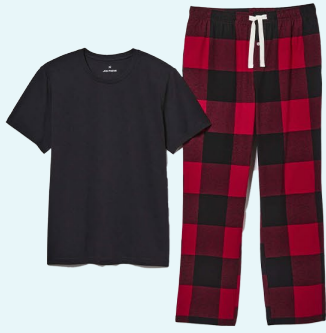
JOE FRESH, $35