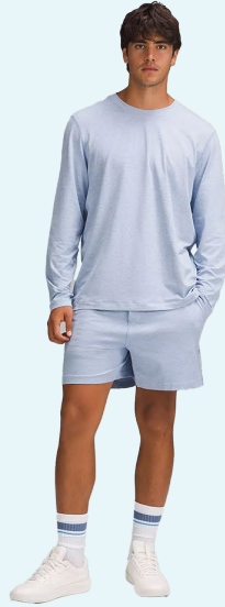
LULULEMON, FROM $68