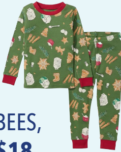
BURT'S BEES, FROM $18