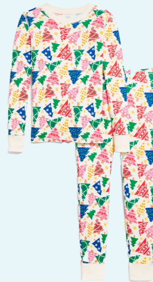
OLD NAVY, $29