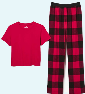
JOE FRESH, $35