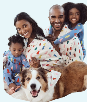
HANNA ANDERSSON, FROM $50