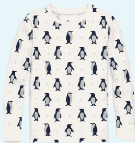
PRIMARY, FROM $20