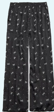
AERIE, FROM $39