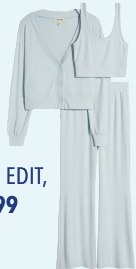
OPEN EDIT, $99